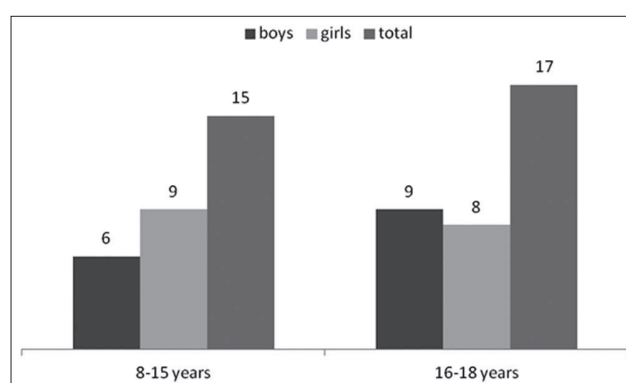
Figure 1: Age and sex distribution of children and adolescents with psychiatric disorders

In the age group of 8-15 years, the number of children and adolescents with emotional, disruptive, and developmental disorders was 4:3:2 (phobia and dissociative [three]; hyperkinetic disorder and impulsive disorders [two]; and mental retardation [two]; respectively; a 13-year-old boy had comorbidity of impulsive disorder and phobia). In the age group of 16-18 years, the number of adolescents with emotional, disruptive, and developmental disorders was 5:0:1 (anxiety, depression, acute stress reaction, and dissociative [two]; nil; mental retardation; respectively; a 17-year-old girl had comorbidity of anxiety and acute stress reaction). Figure 2 shows these childhood and adolescent psychiatric disorders in relation to age.