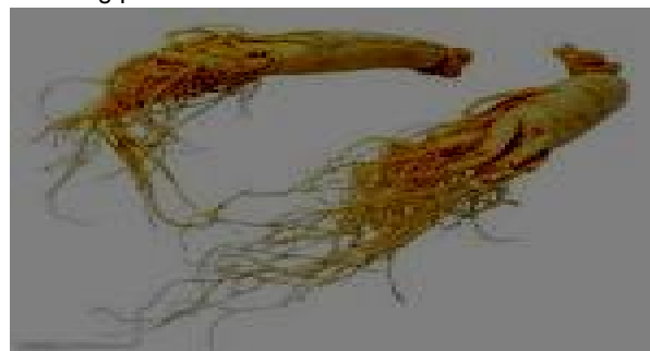
Figure 1. Ginseng Root

GINSENG: From the roots of several plants herbal remedies referred to as “Ginseng” are derived. Ginseng, Panax ginseng C.A. Meyer is one of the most researched ginseng[4]. It is one of the precious plant known among herbs. Figure 1 shows the appearance of ginseng root. Cultivated ginseng can be classified into three types, classification is done on the basis how it is processed: fresh ginseng (less than 4 years old), white ginseng (4-6 years old and dried after peeling) and red ginseng (harvested at 6 years old, Steamed and dried). The main bioactive constituents are ginsenosides[5,6] which are triterpene saponins. There are number of ginsenosides that are isolated from ginseng. Asian ginseng and American ginseng are two variants which is known all over the world[7]. American ginseng is different from asian ginseng in terms of total ginsenosides[8]. Even steaming and heating process changes the ginsenoside profile in ginseng containing products.