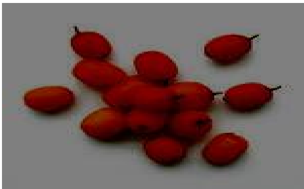
Fig 2: Seabuckthorn Fruits

SEABUCKTHORN: Seabuckthorn ( Hippophae rhamnoides ) a traditional herbal medicine known since 1977. It is being used as a drug since ancient times[14]. Seabuckthorn fruits which includes flesh as well as peel, seeds and leaves are of value[15]. Figure 2 shows seabuckthorn fruits. Fruit/Fresh berries are rich source of vitamin C; Vitamin E; Folic acid, Carotenoids- including Beta-carotene, lycopene, Zea Xanthine (which contribute the yellow-orange-red colors of the fruit), Fatty acids(oils)- the main unsaturated fatty acids are oleic acid(omega-9), Palmitoleic acid(omega-7), Palmitic acid and linoleic acid(omega-6) and linolenic acid(omega-3); there are also saturated oils and sterols (mainly beta-sitosterol), Flavonoids(mainly isorhamnetin, Quercetin glycosides and Kaempferol)[16]. 100gms of fresh berries is having around 600mg of Vitamin C. Oil can also be extracted from seed, pulp and fruit residue. The extracted oil have less of the flavonoids and almost zero amount of Vitamin C of the fruit but are rich in fat soluble vitamin and plant sterols.