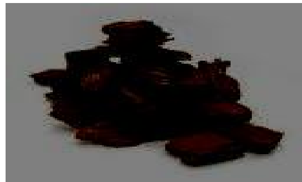
Figure 4. Pine Bark Extract

compound like- polyphenols monomers, Procyanidins and phenolic acids-derivatives of benzoic and cinnamic acids are present which are having anti-inflammatory, anti-mutagenic, antimetastatic, anticarcinogenic and high antioxidant activities. Researchers termed the group of antioxidants found in PBE as "Oligomeric proanthocyanidins" or OPCs/PCOs for short. OPCs are some of the most powerful antioxidant available [33] . Red wine, grape seed extract, cranberries, blueberries, apples and tea are also having these OPCs. Grape seed extract is the cheapest alternative of Pine bark extract.